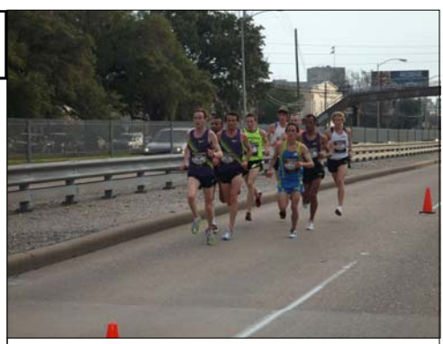
Men's 1/2 Marathon Championship Saturday race leaders

The 3:15 pace group experiment went quite well. There must have been 20 folks at the start. So many of the guys were