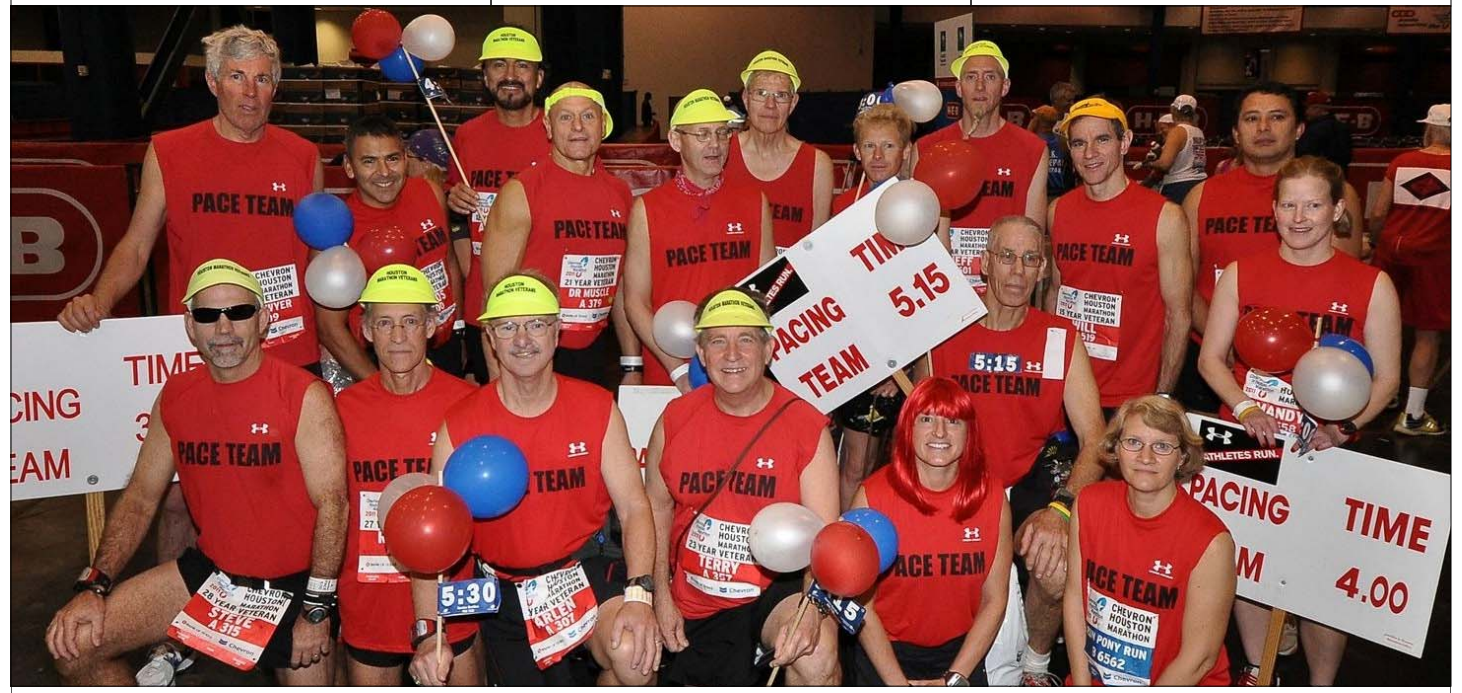
Houston Marathon Pace Team 2011

Mile 1 a little slow but not too bad considering the congestion at the start, but by mile 1 ½, without any warning and on a scale of 1-10, I was at a 9 and needing (Continued on page 6)