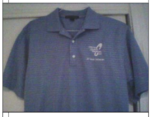
2011 Veterans Golf Shirt

Sign me up for next year. I'm hooked. This is the way to run/walk 26.2.