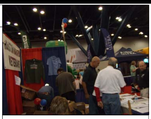
Busy Booth Operations

About this time my items from my belt keep falling on the ground, (more drama to the mix), as I am stabbing items back in place AND trying to keep pace, I realize my Garmin was on upside down and that is why when I was hitting the ON button, it was really the MODE