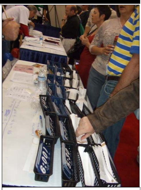
Pace Bibs & Pace Bands

After telling several runners who were following us around after the veterans & pace team pictures that we would meet them at the start, we made a quick run to the upstairs bathrooms using the elevators and then walked to the back of the blue start. Several runners came up and said they had run with me before at the 5:30 group. Our starting line delay for the second wave was almost 4